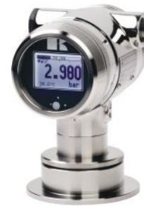
Intelligent Pressure Transmitter