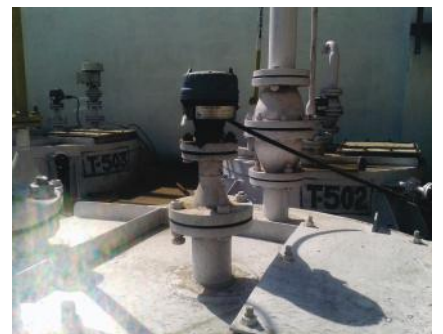
RF Capacitance transmitter with rod probe