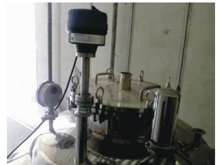
RF Capacitance transmitter with rope probe