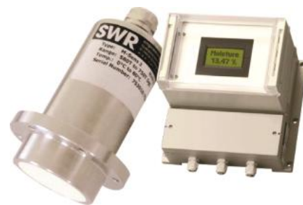
Online Moisture Analyzer