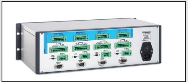
Channel connectors on back of MCU

Liquidew I.S. is available in a multi-channel format (MCU). This MCU enables up to four measurement channels within a single 19" sub-rack unit. The sister product for moisture in gas analysis, Promet I.S., can be combined together with Liquidew I.S. into an MCU to enable both gas and liquid samples measurement with a single analyzer system. With the MCU, each measurement channel functions independently, so that any maintenance on one channel will not affect the others. Customers can also order blank channels for future expansion.