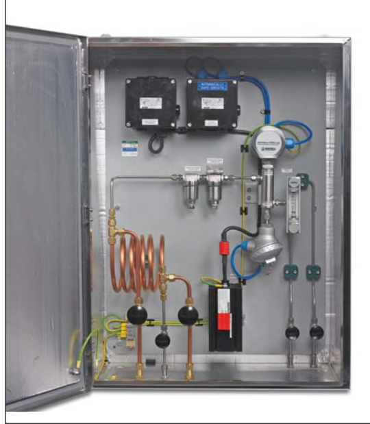
Liquidew I.S Sampling system

The design of the Liquidew I.S. Premium Sampling System has drawn on Michell's 35 years of expertise in on-line process gas analyzers. Particulate filtration is provided in single or dual stages so that sensor and system performance is maintained even in processes prone to contamination. A panel-mounted version of the sampling system and sensor are offered for internal installations, while various enclosures and heating options are available for field installation next to the sample source. Sample cooling, using a water heat exchanger, is available for process fluids at elevated temperature.